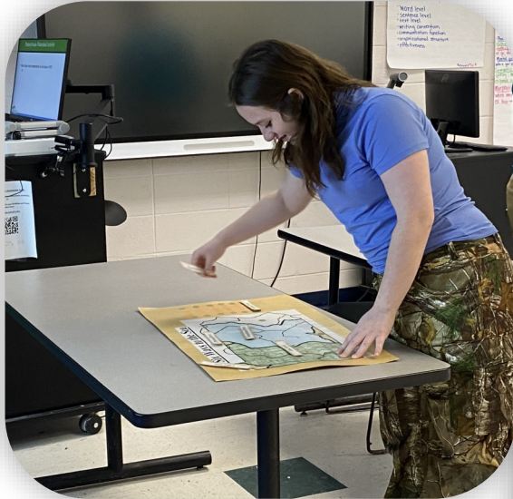
Left: Student shown labeling major watersheds in Pennsylvania.